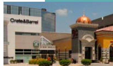
Shop 'til you drop at The Fashion Mall, connected to the Sheraton by skywalk.

"Best conference I have ever attended! I learned something pertinent and beneficial in every class. Not one bit of time was wasted on unnecessary 'fluff.'"